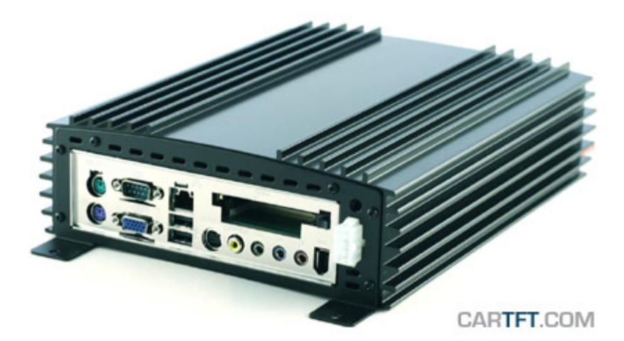
Support: Assembling Tutorial (M1-ATX) [DE] | Assembling Tutorial (M1-ATX) [EN] | Manual [EN] | Connector Cable [DE] | Connector Cable [EN]